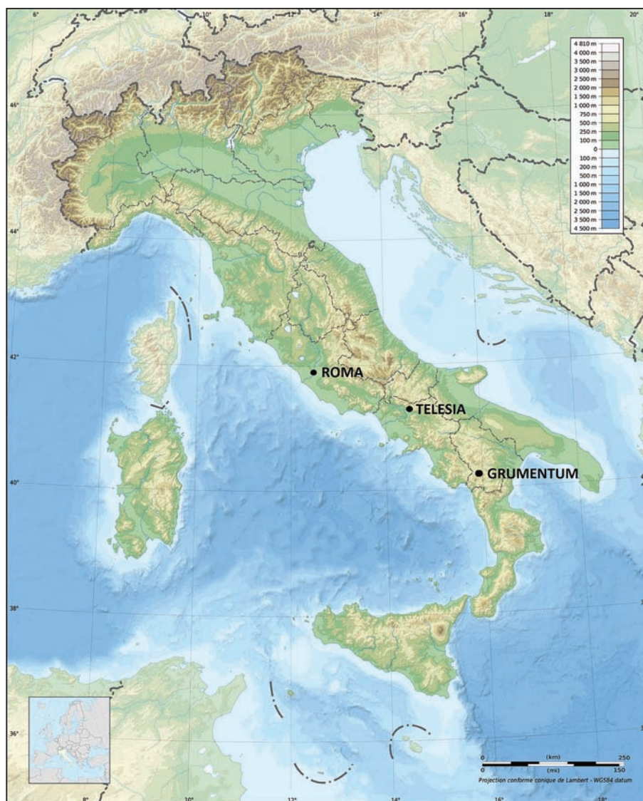
Fig. 1. Map of Italy showing the locations of Telesia and Grumentum relative to Rome (map adapted from original by Eric Gabba and NordNordWest, http://en.wikipedia.org/wiki/File:Italy_topographic_map-blank.svg ).

(of which only a few paragraphs remain) states that half the amount of certain construction-fines were to be paid to the treasury, and half were to be used by the magistrate who exacted the fine on the games he was to give, or on a monument. Perhaps the most obvious interpretation of this passage is that the money a magistrate exacted would, thus, be added to the funds for the games he had to stage, since the law refers to the games in the future tense. The Caesarean lex Coloniae Genetivae allowed duoviri to add 2000 HS from the public funds to the 2000 HS they had to spend on games; the aediles were allowed to add 1000 HS. Therefore, the fines that the lex Tarentina refers to were most likely an addition to the public funds of 2000 or 1000 HS allocated to the magistrates. It is reasonable to conclude that the inscription from Pompeii