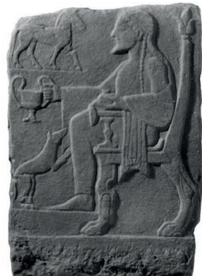
Fig. 7. Stone relief from Chrysapha. Sparta Museum no. 505. After Salapata 2014, web pl. 7.10.

mostly from the perspective of consumption. It has discussed the multiple ways people might have valued modest offerings and how these were related to their lives. Even though small inexpensive offerings were affordable by poorer people, their dedicators likely came from all walks of life. Various factors may have influenced the choice of modest objects as dedications. People were sometimes driven by personal concerns or the circumstances of their visit, and by the occasion of the offering. They could have been influenced by the nature and character of the recipient deity or type of sanctuary, by specific rituals practised in the sanctuary, or by regional dedicatory practices and preexisting offerings. The selection of offerings might have been limited by practical considerations that included not just cost but also portability or availability of types at local workshops and sanctuaries.