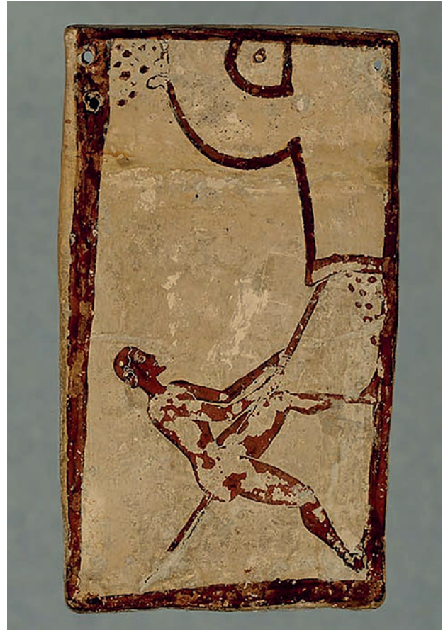
Fig. 3. Reverse side of the plaque depicted in Fig. 2: firing a potter's kiln. Louvre Museum no. MNB 2856. Published with the Museum's permission. http://cartelfr.louvre.fr/cartelfr/visite?srv=obj_view_obj&objet=cartel_6719_29030_g018685j.002.jpg_obj.html&flag=false .