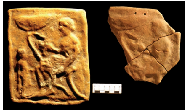
Fig. 1. Terracotta plaques from the sanctuary of Agamemnon and Alexandra/Kassandra at Amyklai; second generation replicas. Sparta Museum nos. 6229/1 and 6229/5. After Salapata 2014, web pl. 1.278

It is also likely that the type of some offerings was determined by the occasion, depending on whether the favour asked was small or big. When life was good and without major worries, simple rites would be enough to keep open the lines of communication with the divine world. 60 Thus, “routine” piety, such as a casual visit to a sanctuary or presentation of a portion of earnings, like first fruits, 61 would have called for frequent simple tokens of respect offered by both poor and rich individuals. 62 For example, Ioanna Patera suggested that within the Sanctuary of Demeter on Acrocorinth, simple offerings were used as a type of entry fee from one area to another. 63 Conversely, moments of crisis or special occasions may have called for richer offerings from those who could afford them. Thus, wealthier people could have dedicated both expensive and token offerings depending on the occasion.