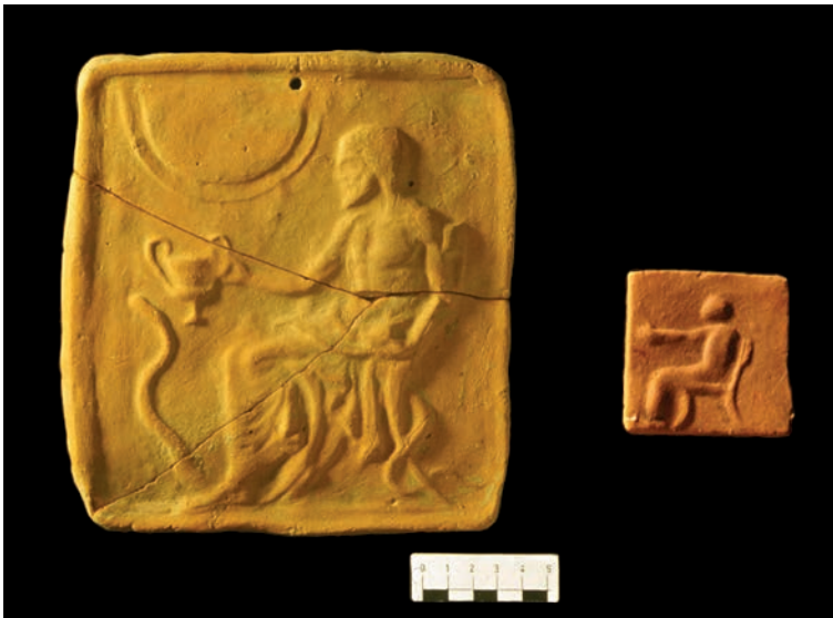
Fig. 6. Terracotta plaques from the sanctuary of Agamemnon and Alexandra/Kassandra at Amyklai. Sparta Museum nos. 6230/1 and 6039/48. After Salapata 2014, web pls. 1.17 and 1.23.