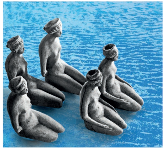
Fig. 5. Reconstruction of positioning of terracotta figurines from Grotta Caruso. Based on Costabile 1991, 116, fig. 191.

cults dedicated to nymphs. 81 It would find a parallel in a fragment of Kallimachos (Callim. Aet. 66.1–9) where, in addressing the water nymph Amymone of Argos, he mentions that the honour of weaving the ritual garment for Hera would be given to maidens only after they had sat down on a rock in the fountain and poured water over themselves. 82