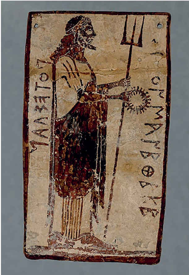
Fig. 2. Painted plaque from Penteskouphia representing Poseidon. Louvre Museum no. MNB 2856. Published with the Museum's permission. http://cartelfr.louvre.fr/cartelfr/visite?srv=obj_view_obj&objet=cartel_6719_8597_g018685j.001.jpg_obj.html&flag=true .