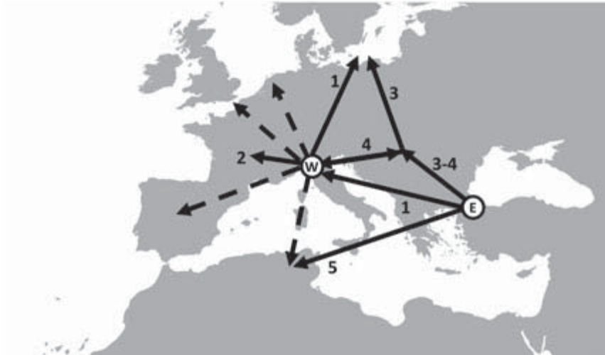
Fig. 1. Possible distribution routes for eastern gold (E) to the Western Empire: Route 1: Constantinople > Northern and Central Italy > Pannonia > Barbaricum. Route 2: Constantinople > Northern and Central Italy > Gaul > Britain and Spain. Route 3: Constantinople > Balkans > Barbaricum. Route 4: Constantinople > Balkans > Barbaricum > Northern and Central Italy. Route 5: Constantinople > Southern Italy, Sicily and North Africa.

Table 3 shows that it is impossible to generalize about vast amounts of solidi being in the hands of common folk throughout the Late Roman world, merely because of a handful of 5th-century letters from Heracleopolis in Egypt in which people borrow a single gold coin from a local usurer. 69 Instead, the evidence of the solidus hoards suggests that separate circuits of the Roman state apparatus operated according to the means available to them. For any outsider to come in from another branch of the imperial administration, that person and his entourage would literally have to bring in new cash with them to operate the network or raise the means upon arriving in the area in question, something that became increasingly difficult in the 5th century. This means that the comparative material of solidus hoards has to be assessed from a regional perspective before the general picture can be ascertained.