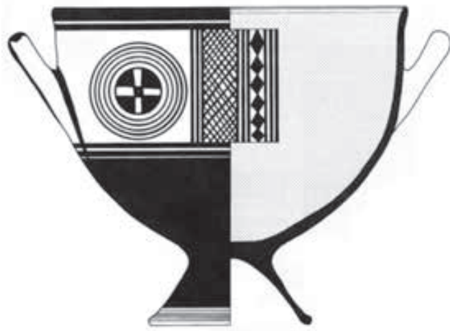
Fig. 11. Drawing of 24 (Knossos, North Cemetery 207.7). Drawing courtesy British School at Athens.

24. Knossos, North Cemetery 207.7 (Fig. 11) Coldstream & Catling 1996, 197, 398, fig. 124, Tomb 207, no. 7.