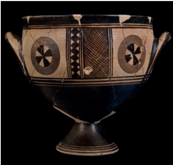
Fig. 2. One side of 2 (Acropolis South Slope, FM 86, 1957 – NAK 461).