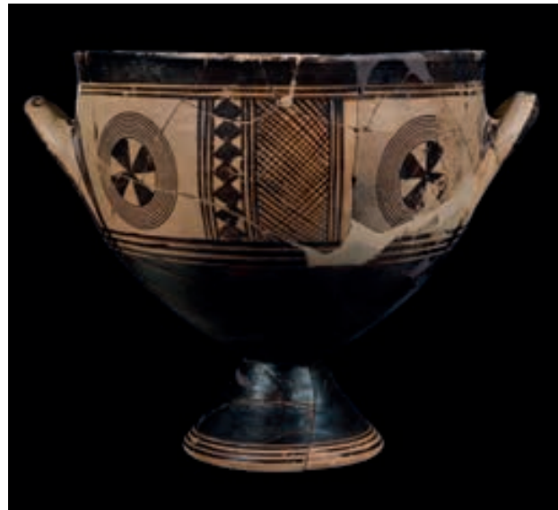
Fig. 1. One side of 1 (Acropolis South Slope, ΓΜ 86, 1957 – NAK 460).

Tall conical foot, splaying slightly toward base, with outer profile very slightly concave. Lower body rising to vertical upper body; slightly flaring rim, with plain rounded lip; rim ovoid in plan. Two horizontal handles, circular in section, attached to upper body and rising at an angle of about 45°. Wheelmarks prominent on interior.