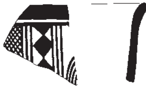
Fig. 8. Skyphos fragment, 11 (Asine, Barbouna area). After Hägg & Hägg 1978, 109, fig. 102, no. 59.

Wells 1983b, 206–262, figs. 197–198, nos. 784, 787–788 (note also no. 783, with the lozenges of the vertical lozenge chain individually decorated and no. 791, with crosshatched panel framed by vertical dogtooth).