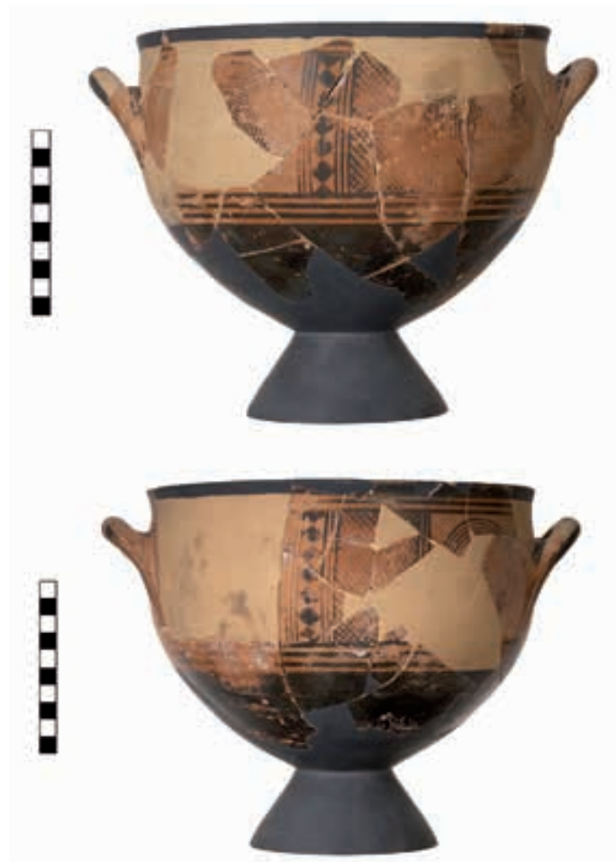
Fig. 7a–b. Photos of both sides of 8 (Sanctuary of Zeus on Mt. Hymettos).