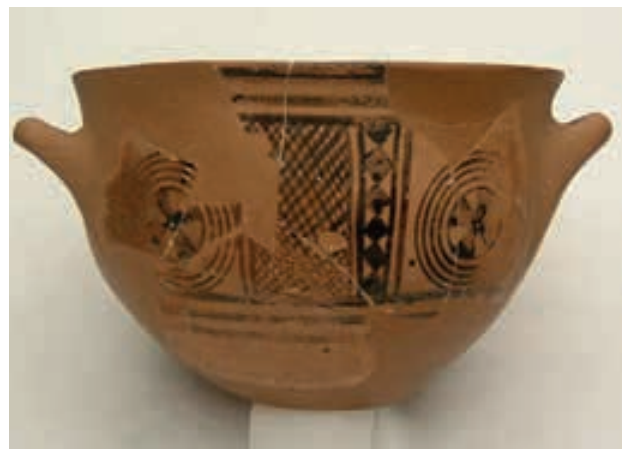
Fig. 4a–b. Both sides of 6 ( Kerameikos , inv. 606).