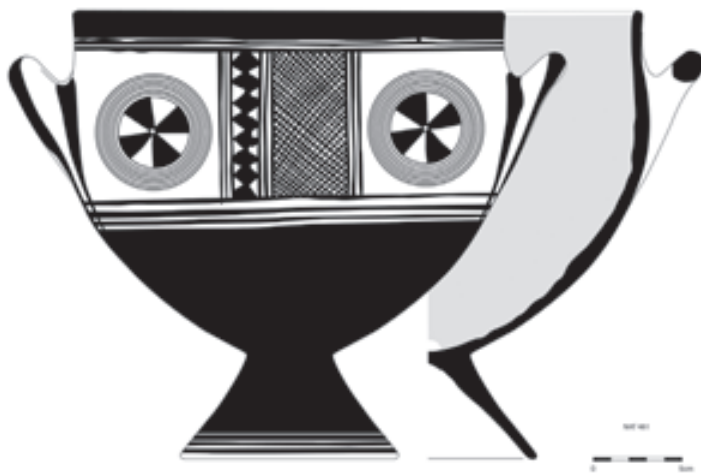
Fig. 3. Drawing of 2 (FM 86, 1957 – NAK 461). Drawing Anne Hooton.

flare; remainder of rim, including lip top, painted solid. The handle zone, thus defined, is decorated on either side, with the following: Central panel composed of two uneven segments, that to the right broader and crosshatched; that to the left decorated with a vertical row of seven lozenges (the lowest lozenge on one side curtailed, almost a triangle). Both