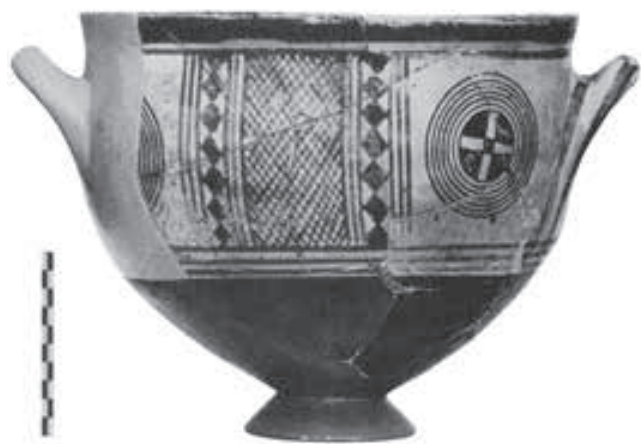
Fig. 5. One side of 7 ( Nea Ionia , no. 46, National Museum , inv. 18109 (the foot is a modern restoration)).