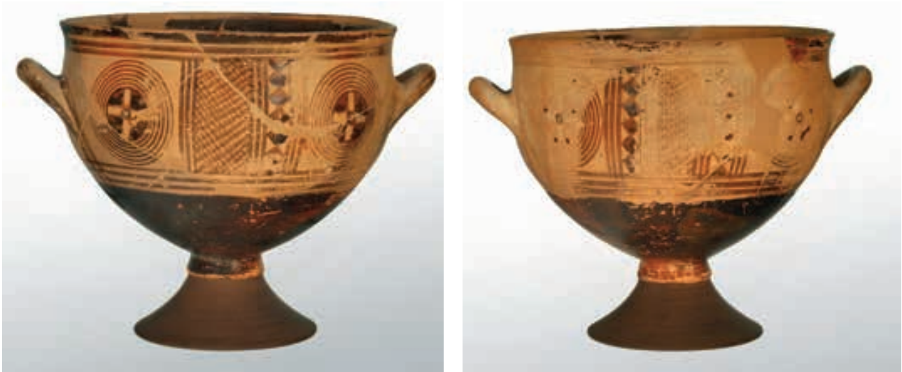
Fig. 10. Three views of 22 (Würzburg, Martin von Wagner Museum, inv. H 5393, said to be from Melos).