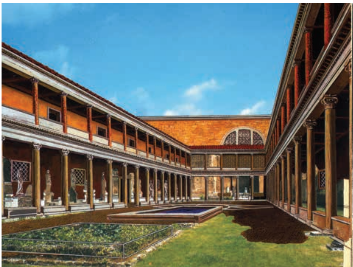
Fig. 2. The Casa delle Vestali. After Hülsen 1905.