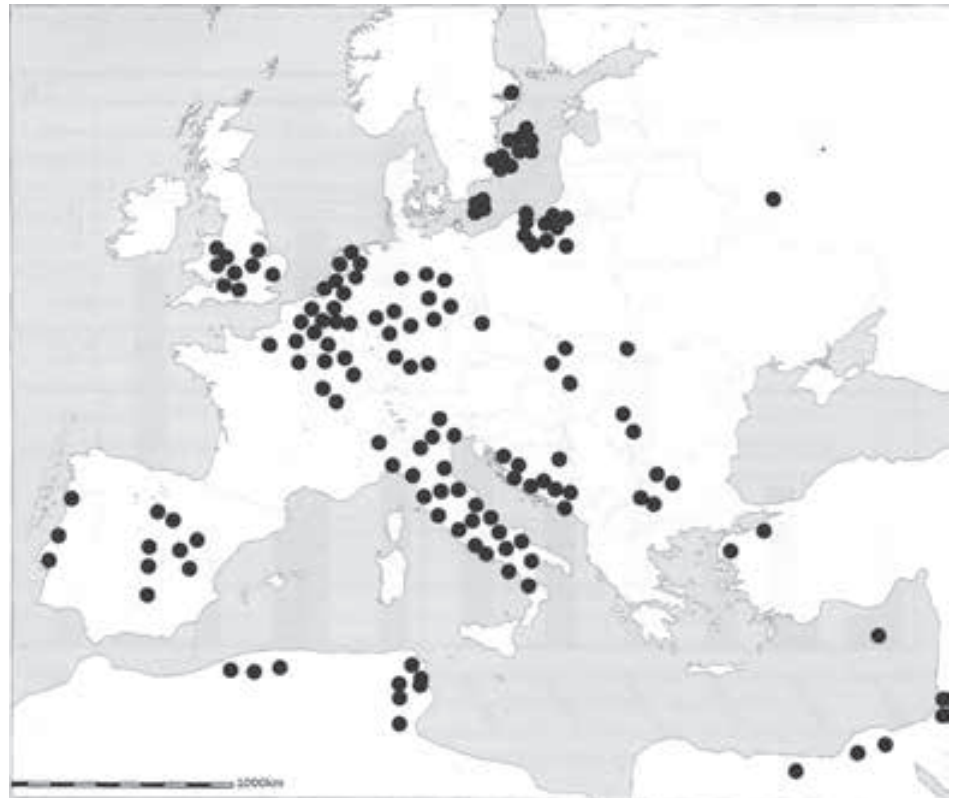
Fig. 3. Solidus hoards recorded in LEO, AD 306–641 (by Helena Victor; see Fischer 2011).

critically evaluate recent finds and future analytical strategy because Sweden and Denmark are about to diverge entirely as far as new finds from reliable archaeological contexts are concerned.