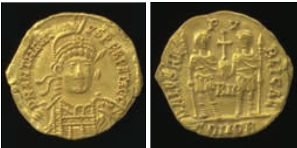
Fig. 7. Obverse–reverse: Fagerlie 169, RIC X 2808, Rome mint. Åby Hoard, Sandby Parish, Öland.

hoard via the imperial mint in Rome. Another possible link between the Vedrin and Vestal hoards is that the Vedrin hoard contained coinage from the solidus stock of the military state apparatus in Italy. 60