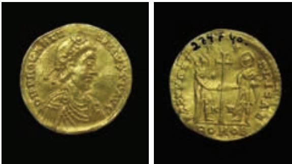
Fig. 5. Obverse–reverse: Fagerlie 168, RIC X 2866, Ravenna mint. Övede Hoard, Eskelhem Parish, Gotland.