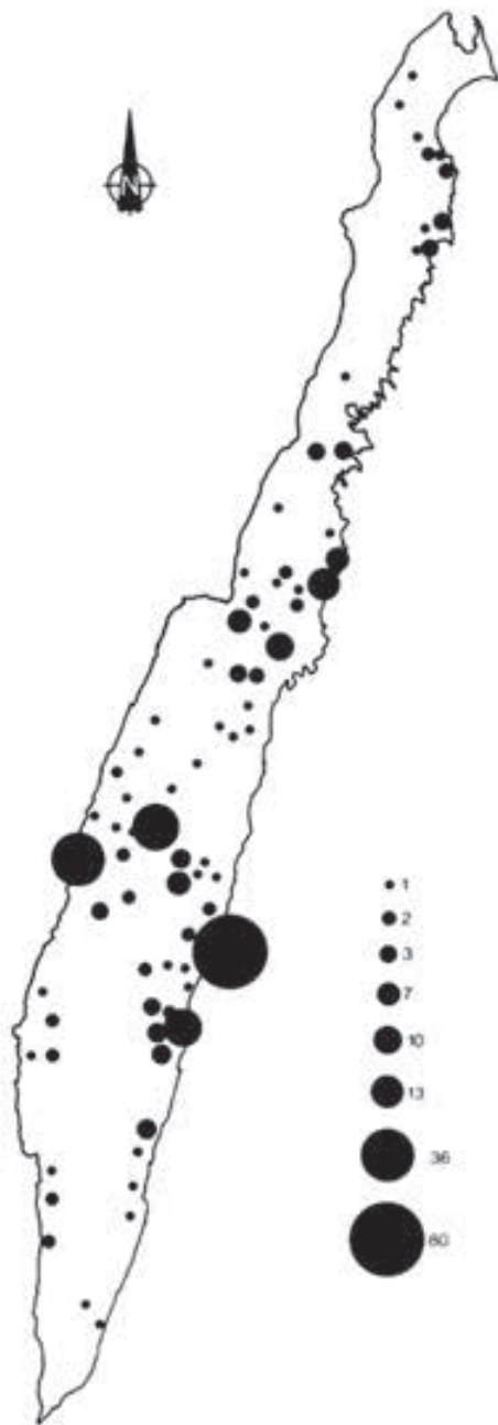
Fig. 4. Distribution of solidi on Öland. By Teodora Linton Fischer, after Herschend 1980.

have caused the solidus material to become very fragmentary. 40 Still, it is safe to say that the Polish material does not exhibit any immediate connection with the Vestal hoard. Similarly, there is no apparent pattern within very large hoards, where a token sample of Anthemius occurs due to the sheer quantity of assembled coins (as in the case of the Naples and Botes hoards). A further analysis of the solidus material discussed by Italian scholars reveals a strong link between the Italian and the Scandinavian material, where previously odd, small-hoard compositions in Italy make sense from a comparative Scandinavian perspective. This suggests that the Scandinavian hoards may already have been assembled as such in northern Italy prior to their exodus north, making the intermittent Polish connection sometimes alluded to by Fagerlie unlikely. 41