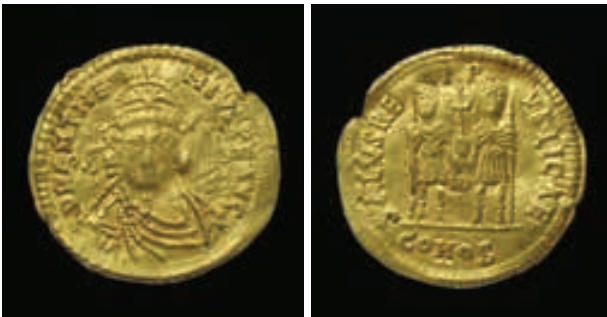
Fig. 6. Obverse–reverse: Fagerlie 155, RIC X 2899, Milan mint. SHM 5186, Öland.