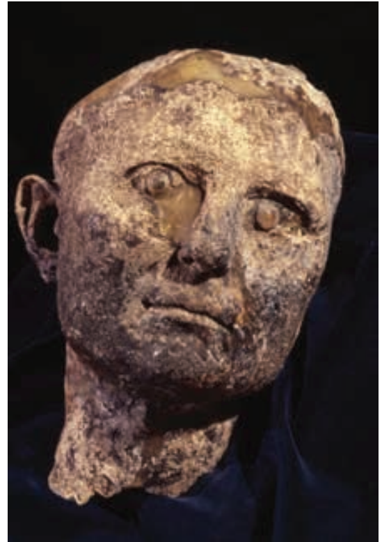
Fig. 3. Wax head of Cuma, 2nd century AD, Naples National Museum, Room 97.

The passage above does not mention any term meaning “mask” but only a verb indicating that the imagines (εἰκόνας) “were put around” (περιτιθέντες), which does not exclude the possibility that the imagines were whole heads. Polybius does not use any term meaning “men” or “actors” impersonating the ancestors. Polybius's description is so vague that the only word that could imply impersonators of ancestors is contained in a masculine plural participle (δοκοῦσι) (“those who appear”). The historian refers to the imagines only through the use of demonstratives and verbs in the passive form, which suggests that these imagines did not walk through the procession by themselves. 27 Polybius writes that the imagines were carried in