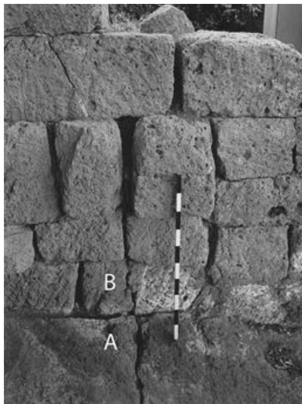
Fig. 124. Cracks in the tufa rock (at A) and the wall D3, block II:5 (at B).