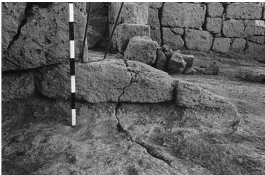
Fig. 127. Crack in wall C6, detail of Fig. 126.

well-known Etruscan “Prophecy of Vegoia”. 223 All this is enough to show that earthquakes and the fear of such were a fact of life in Etruria and Rome, 224 and enough to consider a seismic disturbance in the San Giovenale area as theoretically possible.