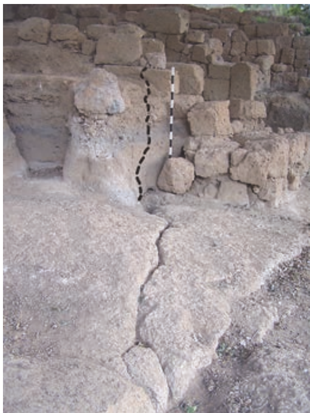
Fig. 123. Crack in the rock Na in room Ab from the north.