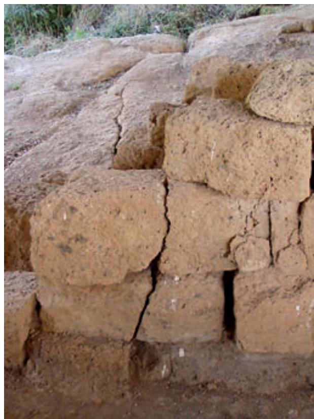
Fig. 125. Crack in the tufa blocks in wall L1 continuing into the bedrock Na, seen from the south.

This conclusion is amply confirmed by the better documented