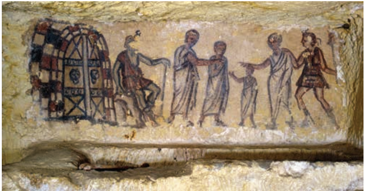
Fig. 6. Tomb 5636, second half of the 3rd century BC, Tarquinia. Photo published with permission of the German Archaeological Institute, photographer: Schwanke, Neg. D-DAI-Rom F82.182.

Roman sources report that in aristocratic funerals the act of opening the door was followed by the procession of the imagines maiorum on parade with the living members of the family of the deceased. 66 As Pliny noted, the imagines “accompany funerals in the extended family. And whenever someone died, the whole crowd of his family members who had ever lived was present”. 67 The fact that the various sources, in describing the funeral, mention the imagines in connection with verbs such as anteferre , efferre , and praeferre , suggests that the imagines preceded the corpse in the procession, 68 whereas Polybius’s usage of the term ἐξῆς “in order” has made Maurizio Bettini hypothesize that the imagines were displayed in chronological order, from the older to the younger. 69