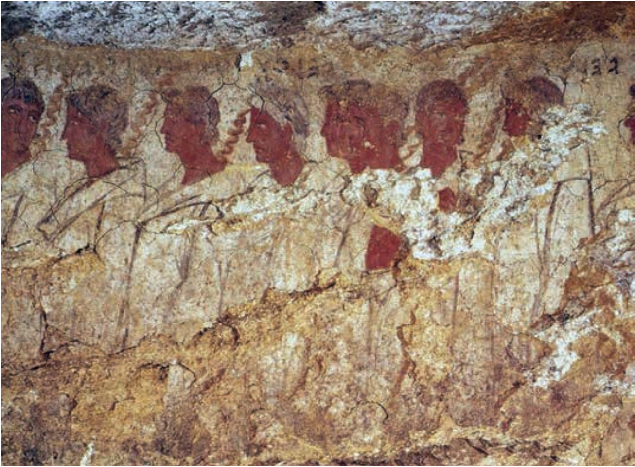
Fig. 7. Tomb of the Meeting, Tarquinia, Procession of togati, first half of the 3rd century BC.

with the ancestors (Fig. 8). 73 Likewise in Roman funerals, the living members of the family proceeded along with the imagines maiorum —representations of the dead. The visual representation in the Bruschi Tomb seems to illustrate important ritual similarities with the description of the Roman funeral. In addition to showing the political status of the magistrates, the processions in the Bruschi Tomb added further layers of meaning that connected the Etruscan tradition to the Roman one: the procession as journey to the Underworld; the meeting of the living and the dead; the ancestors' welcome to the deceased.