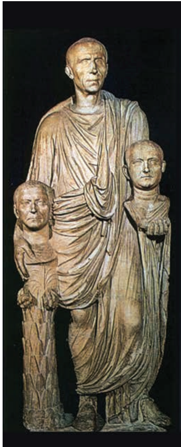
Fig. 1. Barberini statue, early Augustan age, Montemartini Museum, Rome.