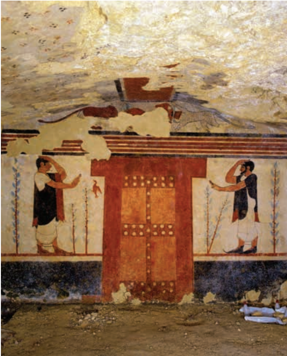
Fig. 5. Tomb of the Augurs, c. 520 BC, Tarquinia, back wall. Neg. D-DAl-Rom F82.85.

into the Underworld) by the gates of the Underworld in the act of welcoming the deceased (Fig. 6). 63