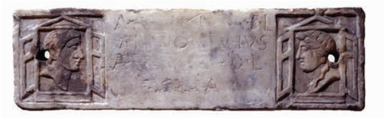
Fig. 4. Marble grave relief, 1st century BC to 1st century AD, National Museum, Copenhagen.

shrines and displayed only on special occasions. 54 Yet, the act of opening the doors of the shrines, which the literary sources never fail to emphasize, might have constituted an integral part of an ancient funerary ritual. 55