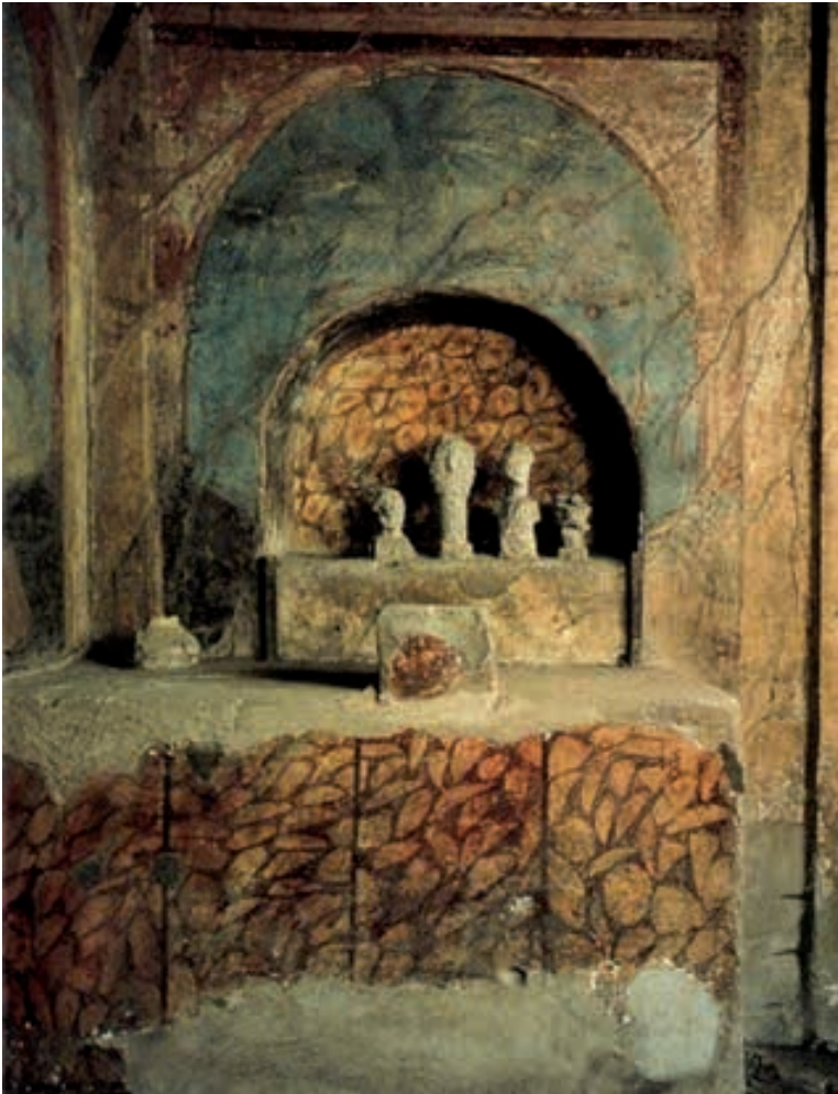
Fig. 2. Ancestral shrine with ancestors' imagines in exedra 25, House of Menander, Pompeii.

visualized appearance of the two portraits, some scholars hypothesized that the imagines were moulded using a direct cast taken of the face of the deceased. 16 Erich Gruen has instead suggested that the two heads of the Barberini statue, doubtlessly ancestral imagines , were created when the subjects were still alive, since both of them feature open eyes and no signs of rigor mortis . 17