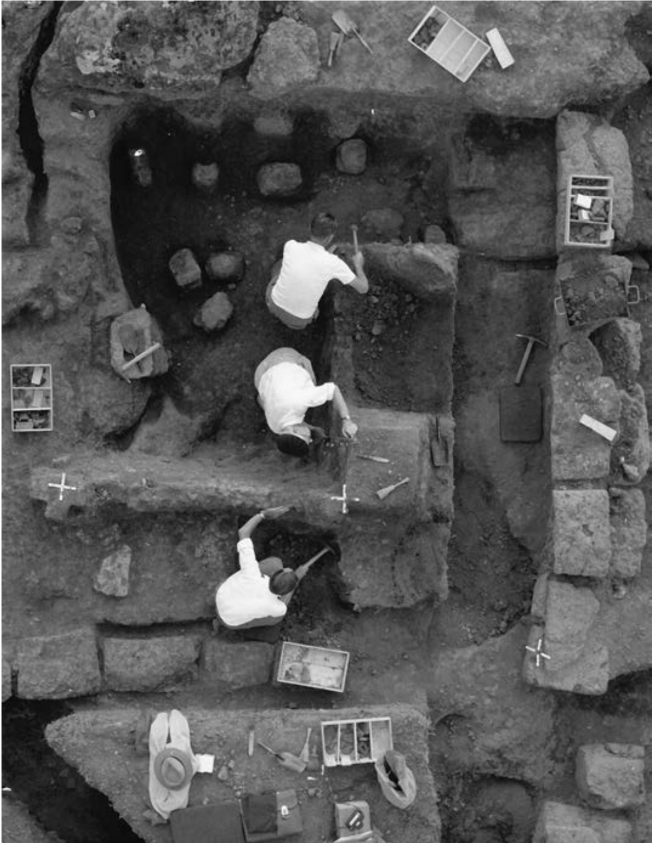
Fig. 53. The excavation of Cantina G in 1962.