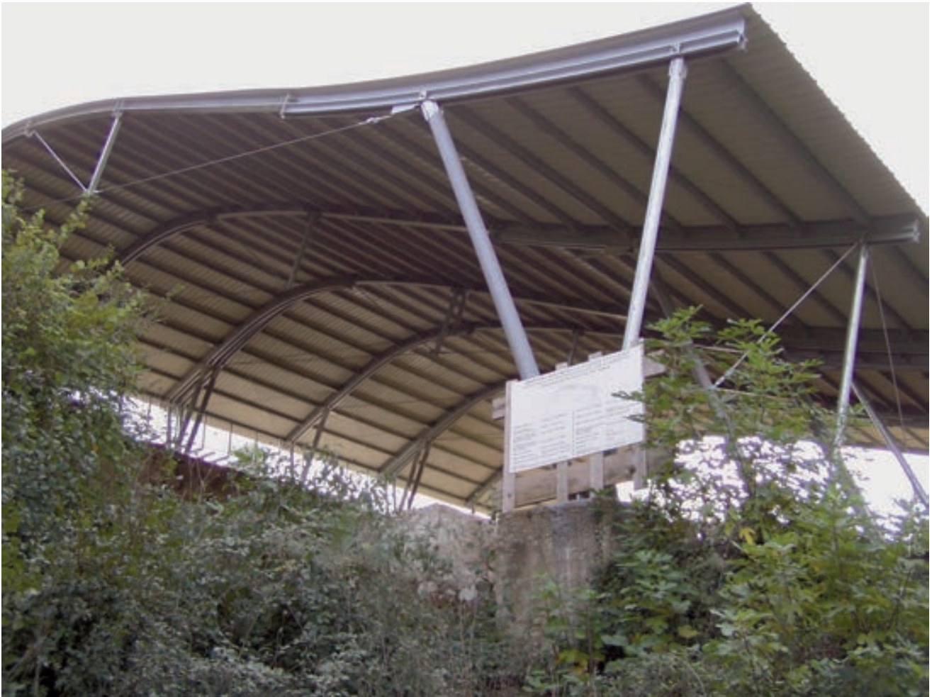
Fig. 31. The new Capannone , from 2002.