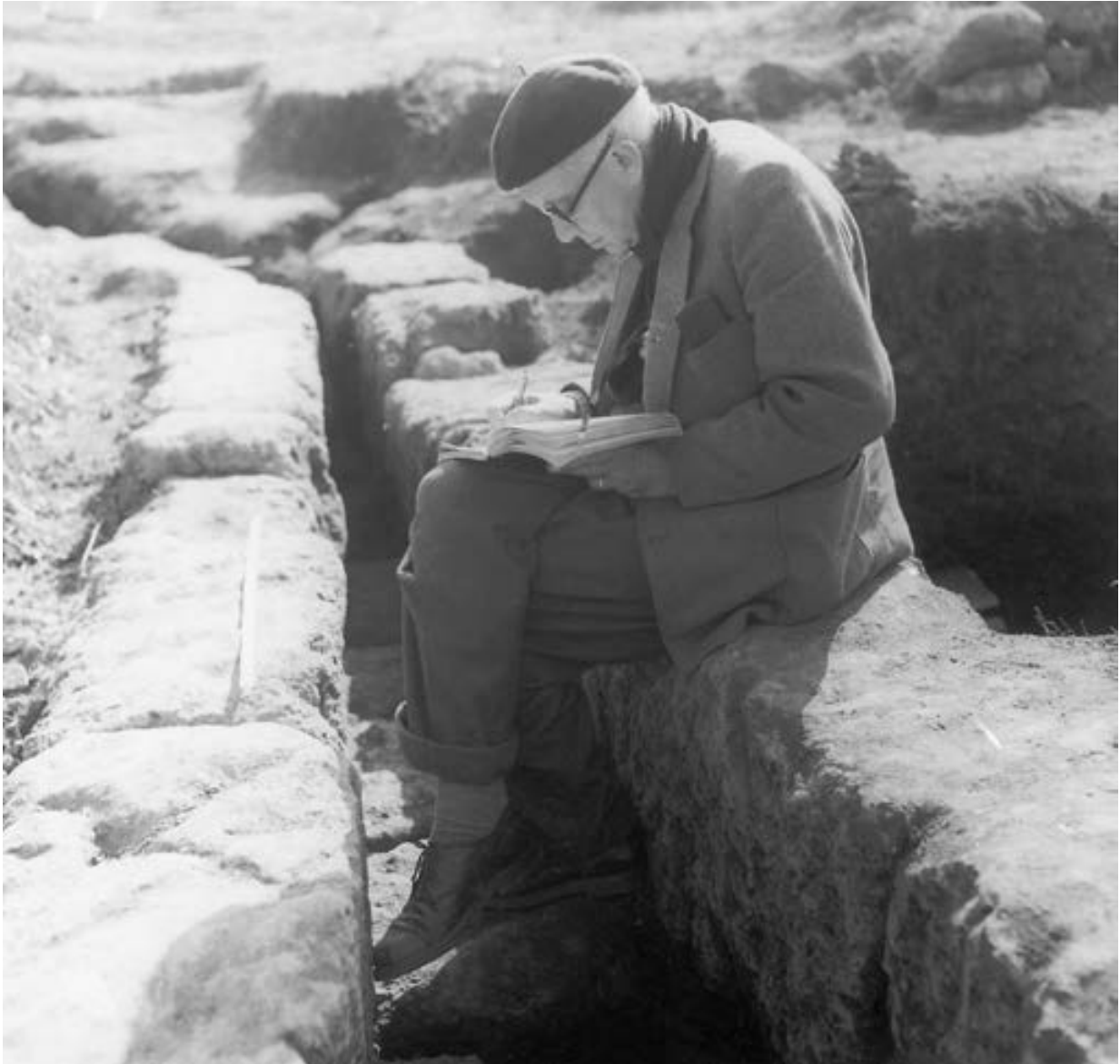
Fig. 22. Professor and director Axel Boëthius in 1957.

from a height of c. 5 m (Fig. 29). It resulted in an extremely useful photographic plan of the entire excavation (Pl. 2). 39