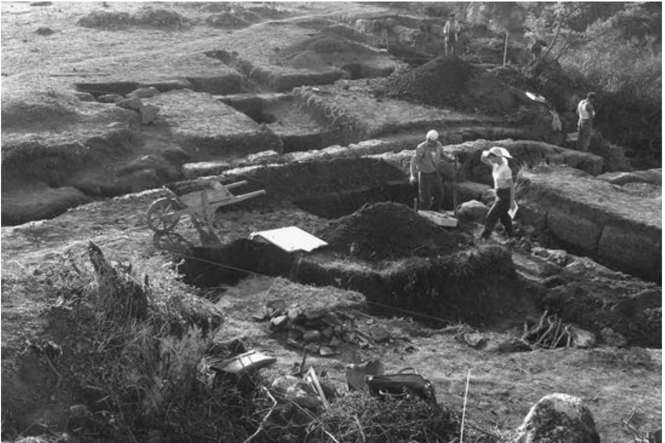
Fig. 23. The Borgo NW excavations 1957.