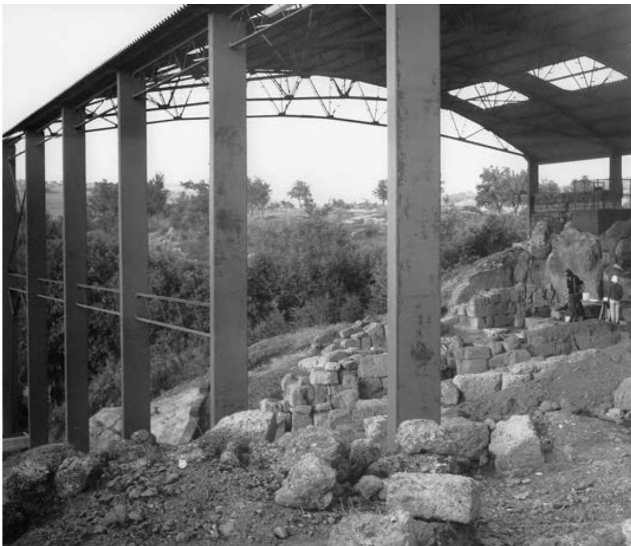
Fig. 30. The old Capannone 1965–2002.

1965 did not see much progress regarding the major excavation zones, in particular the Borgo NW. 43