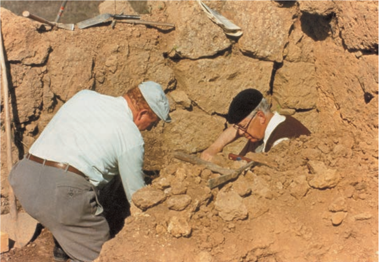
Fig. 27. King Gustaf VI Adolf and maresciallo Onofrio at work in room Ba.

intensified documentation and study in the 1990s some of the now unnecessary features related to the walkways were eliminated, especially a terrace and several artificial fills, all of which had obscured the stratigraphy and complicated the close study of walls and foundations.