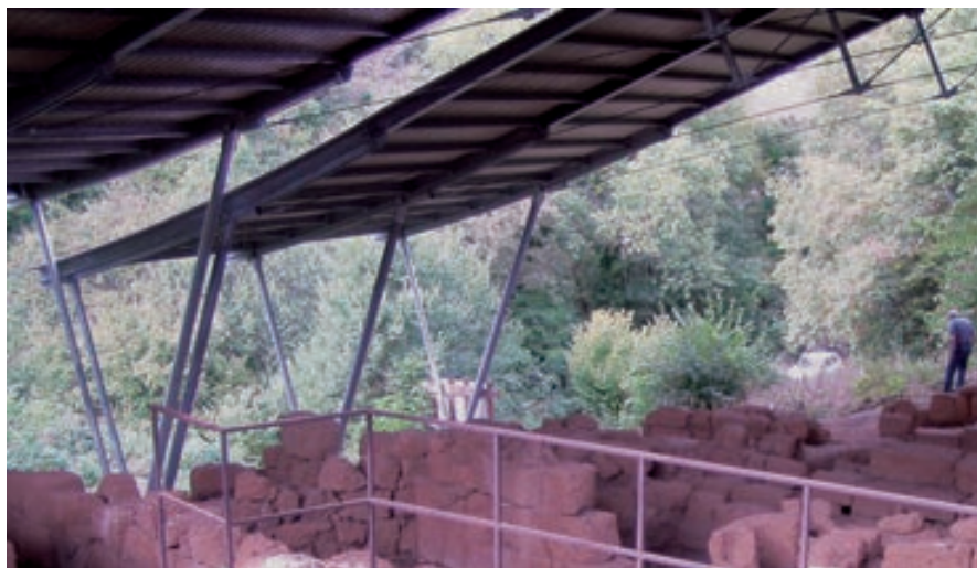
Fig. 32. Detail from the new Capannone in 2002.