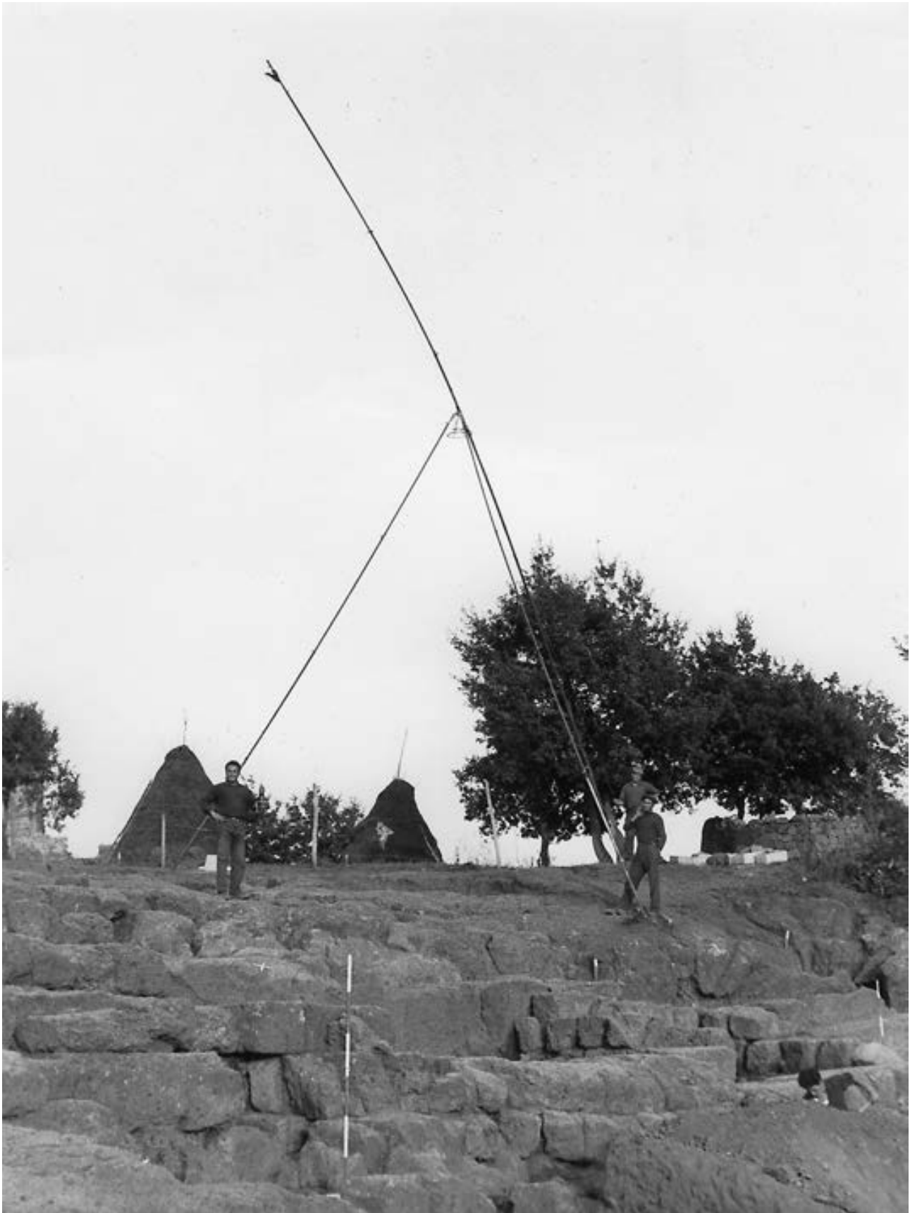
Fig. 29. The photographic tower, la giraffa , in 1961.