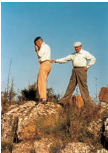
Fig. 28. King Gustaf VI Adolf photographing the Borgo NW with maresciallo Onofrio.

ports to the Soprintendenza and the 1960 report in Notizie degli Scavi . 41 A further, even more serious problem was the economic difficulties of creating an efficient work structure for the demanding publication activity and of correlating excavation and post-excavation work with Swedish university curricula. The requirements on the PhD dissertations were, at that time, that they were supposed to discuss problems rather than producing the mainly descriptive work of regular excavation reports. Thus, when back in Sweden, the San Giovenale excavators, like their peers at Luni sul Mignone, had to concentrate on other academic work. This led to the delaying of the analysis and publication work of their excavations. 42 The dissertations once finished, teaching and other research jobs tended to make the work on the San Giovenale excavations a cura posterior , handled only during too short summer vacations. Thus, the 15 years after the end of the field work in